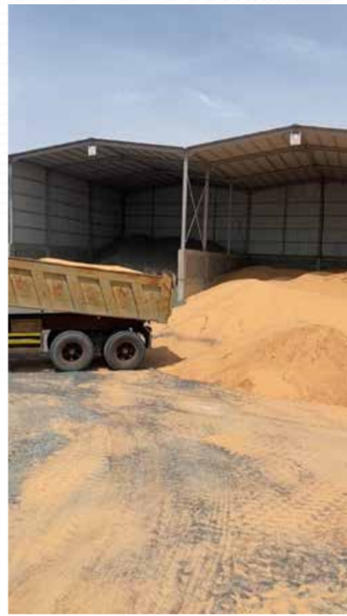
Supply of ready-mix concrete company in Sharma Neom