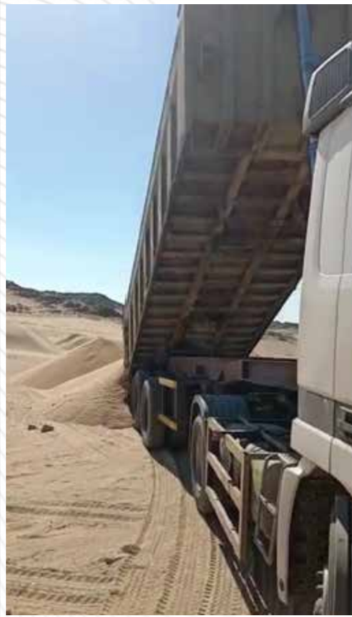
Supplying the Al Yamamah Company in the Sharma Agricultural Project with agricultural soil