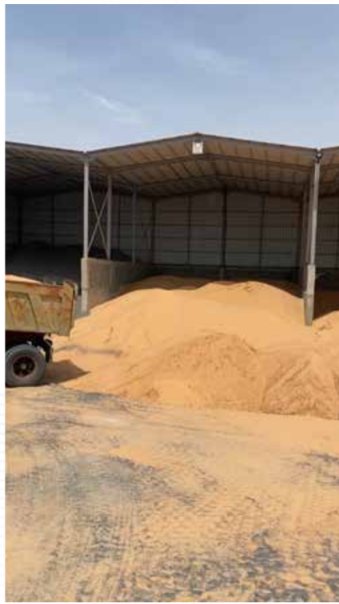
Supply to Saudi Ready Mix Concrete Company