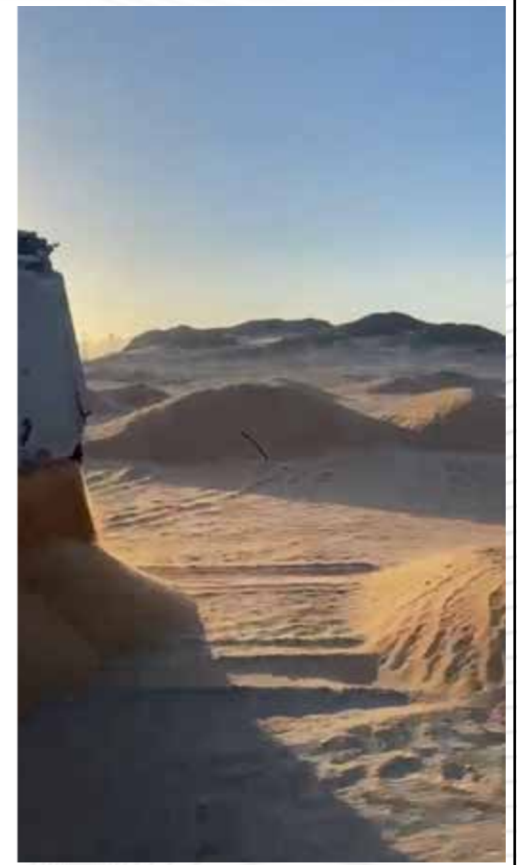
Supply of the institution to the sites of Al-Yamamah in Sharma, agricultural soil